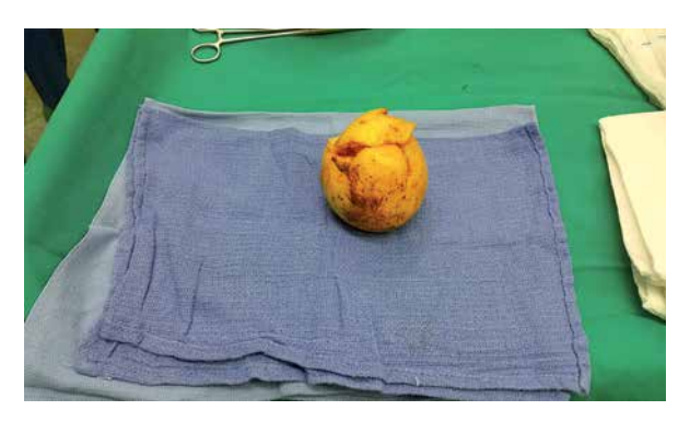
Figure 2 .This single trial succeeded, and the foreign body was identified as a 10-cm-long orange

possibly surgical exploration. He was placed in the lithotomy position with reverse Trendelenburg angulation. The surgeon attempted to remove the object manually with lubrication and by using forceps, while suprapubic pressure was applied by an assistant to help move the foreign body. This single trial succeeded, and the foreign body was identified as a 10-cm-long orange (Figure 2). Post extraction, the patient did not have any complications and no abnormality was detected in sigmoidoscopy and abdominal X-ray. He had no abdominal pain and was discharged in a good condition.